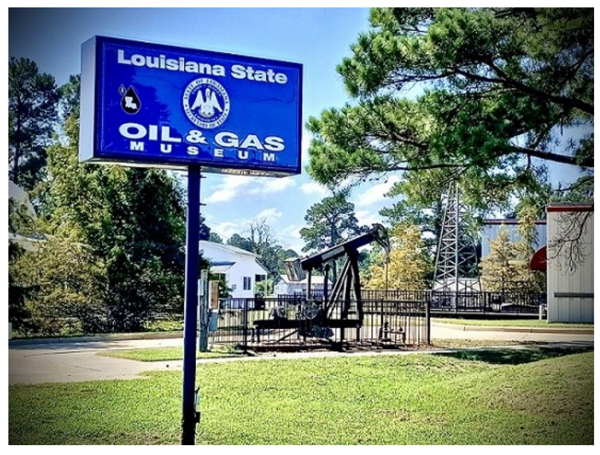
Near Shreveport, Oil City is the home of the Oil & Gas Museum.