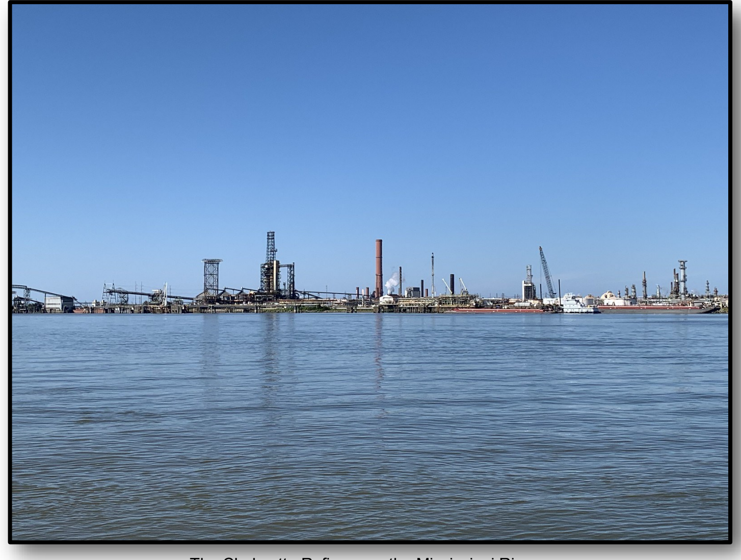
The Chalmette Refinery on the Mississippi River—a view of the refinery from the Chalmette Ferry