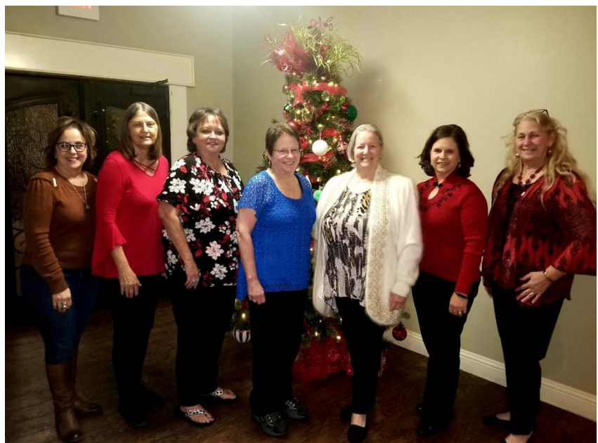
2020 Officers Desk and Derrick Club of Victoria