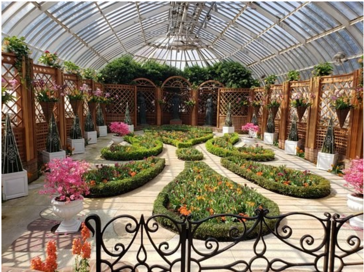
Phipps Conservatory and Botanical Gardens

The Northeast Region will host the 2020 annual Association of Desk and Derrick Clubs Convention and Educational Conference in Pittsburgh, PA. The Sheraton Pittsburgh Hotel-Station Square is the site of the annual business meeting, industry guest speakers, seminars and energy symposium. The hotel is located on the waterfront, in the heart of a 52-acre riverfront complex and offers free shuttle service within a 3 mile radius. There is much to see and do in Pittsburgh. More details to follow.