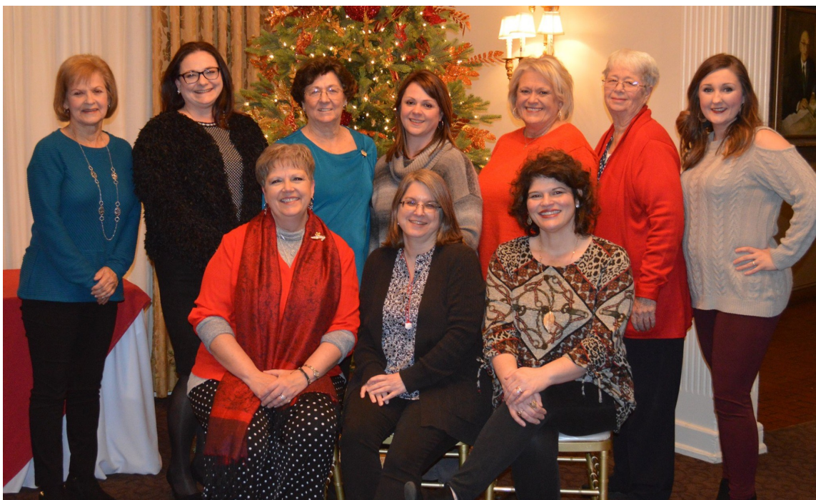
2020 Officers of the Desk and Derick Club of Lafayette