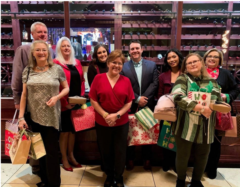
Members of Desk and Derrick Club of Corpus Christi celebrate the holidays.