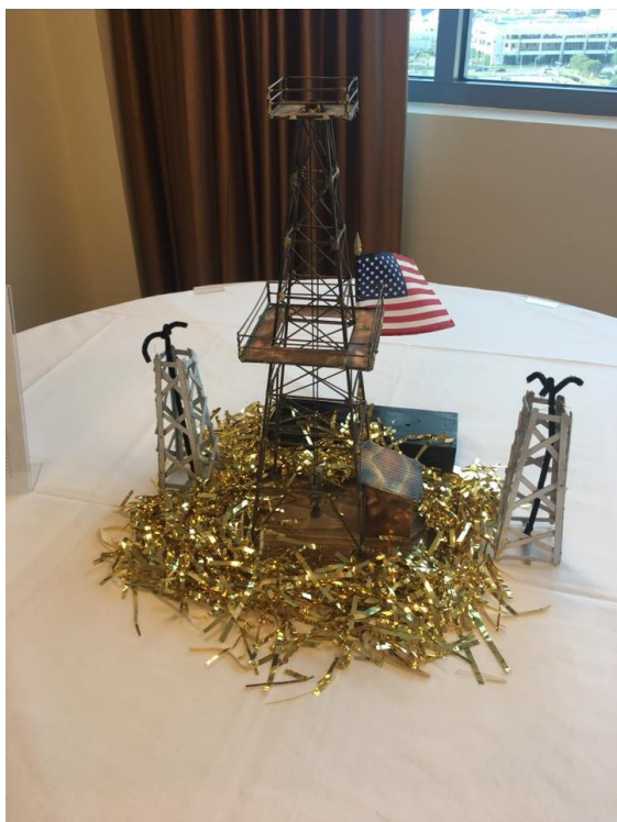
The New Orleans Club celebrated its 68th Anniversary on June 14th. New Orleans Club was, and always will be, #1!