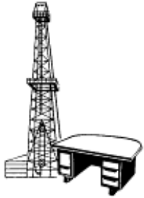
ASSOCIATION OF DESK AND DERRICK CLUBS