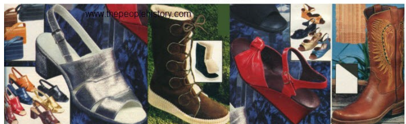
Three Strap Shoe $11.99