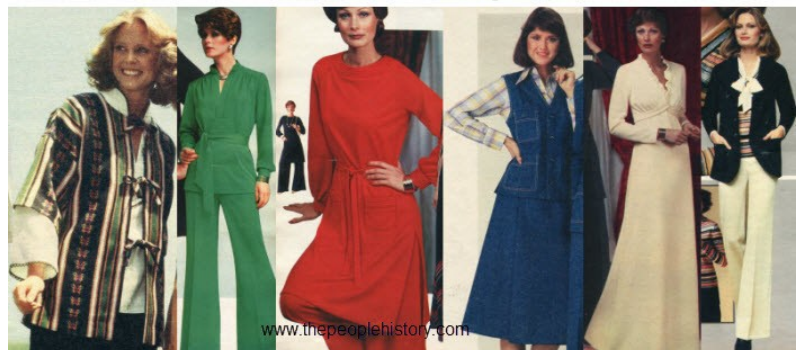
Patterned Jacket $13.97