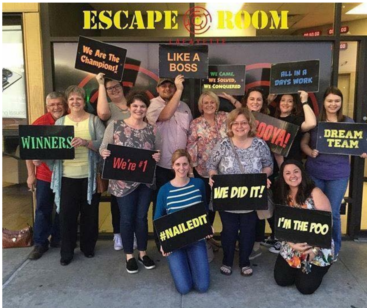
Members of the Lafayette D&D Club Teamwork Training Night, Escape Room