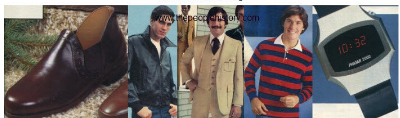
Romeo Slip On Shoe $15.99