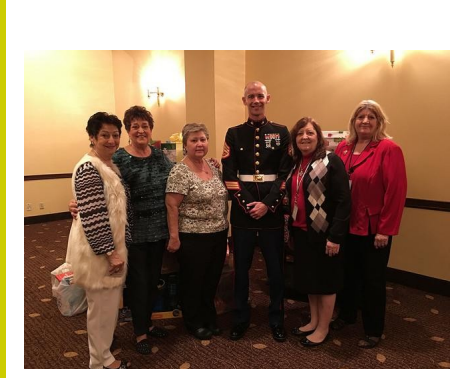
WB Officers present Toys for Tots donations